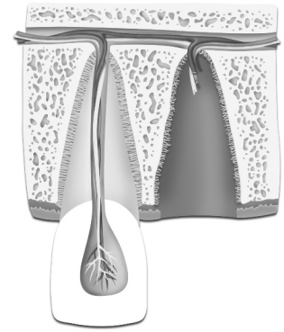
KNOCKED OUT TOOTH